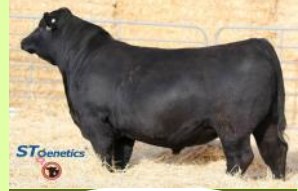
KG JUST CAUSE

Cattle will be in the barn on Friday evening for viewing. Catalogs available on-line.