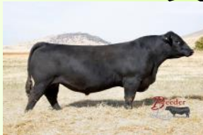
SITZ THRESHOLD 9901