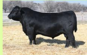
SCHIEFELBEIN ENDGAME 99